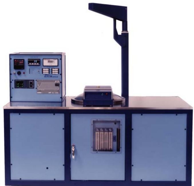
Model B-2300 shown with standard controls and cable hoist

370-G Industrial Road | San Carlos, CA 94070 Phone (650) 593-1064 | Fax (650) 593-4458